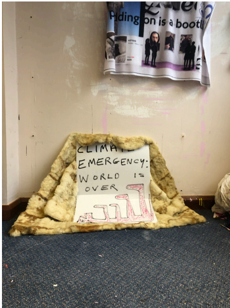
Husk Bennett Untitled (Intervention-Performance), 2023 Durational drawing

Husk Bennett has created a new, site-specific work responding to the news headlines on 'Blue Monday', known as the 'most depressing day of the year'. On Monday 16 January 2023, Husk spent 5 hours in CCA creating 40 new drawings inspired by the articles, headlines and advertisements from the day's newspapers. Blue Monday itself was invented by a travel company. The work looks at the trivialisation of societal issues by the media and capitalism, as well as investigating artists' labour and time. The work will remain on display throughout the exhibition with individual drawings falling under the broad categories of headlines, labour, clickbait, media, consumption, production, publicity.